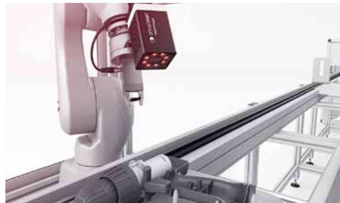
The VISOR® Robotic identifies the exact position of the cordless screwdriver. Offset data is used to correct the robot's trajectory.