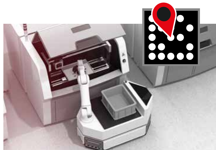
Target Mark technology enables easy identification and precise referencing of your mobile work stations.