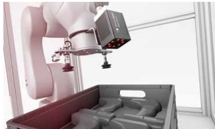
The position of components supplied in a tray can vary so strongly that robot guidance is necessary.