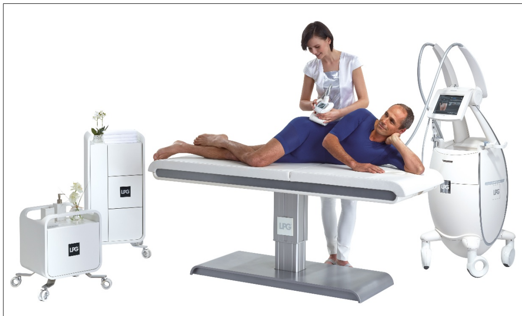
During the kneading-rolling massage the patient wears a suit, designed to make the therapy more effective.

Today some 200,000 people in 110 countries undergo treatment with LPG technology every day. There are two versions of the treatment. The original version, Lipomassage, uses the kneading-rolling principle. The therapist massages the customer using a hand-held device, which is equipped with two rollers controlled independently of each other. They are driven by brushed DC motors. The size of the hand-held device depends on the part of the body to be treated. During the procedure the patient also wears a whole-body suit, designed to support the effect of the massage.