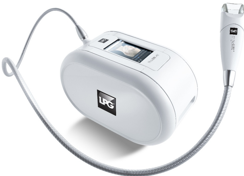
The Endermolift device from LPG is primarily used for facial treatments.