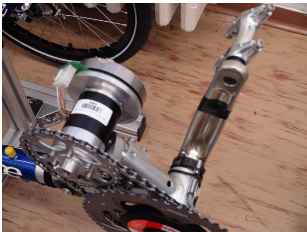
Figure 3: The 90 W flat motor used in the recumbent trike provides enough power for the drive task.