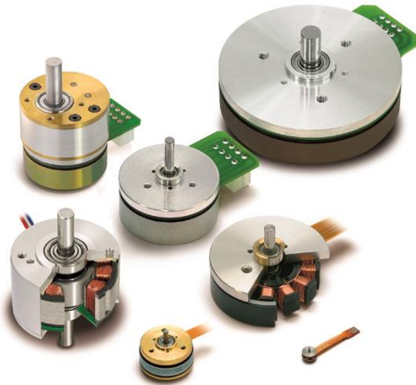
Figure 5: The brushless maxon EC flat motors are the right drives in many applications, due to their flat design