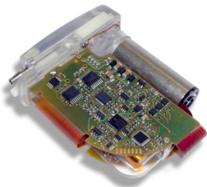
Figure 1: The inside of the gear pump with electronics and the customer-specific EC13 motor.

The maxon EC 13 motor drives the pump gears of the ALFapump and is specially tailored to the requirements of the customer. The motor is equipped with Hall sensors that are important for position feedback. The motor controller uses these Hall sensors to achieve reliable and stable operation, in particular at low speeds and high load torques. In addition to the sterilizable motor having a special stator coating, the shaft is also made of bio-compatible materials. Additionally, special shaft geometry is required. With the compact design of the EC 13, its excellent low-noise and low-vibration running properties and the low heat emission, the drive is specially tailored to the requirements of medical technology. To increase patient safety and reduce the complexity of the ALFapump's programming, an own processor is used for the motor controller. The main processor configures the motor controller, to achieve the desired volume transport. This motor controller checks whether the respective parameters are valid.