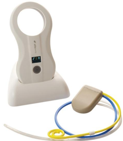
Figure 2: The implant consists of a powerful pump (right) that is powered by a rechargeable battery. To enable increased mobility, the SmartCharger (left) is also operated with a battery.